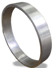
HandyCoat® distance ring