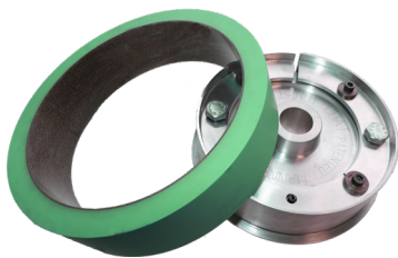
HandySleeve® + HandyBase® = HandyCoat®